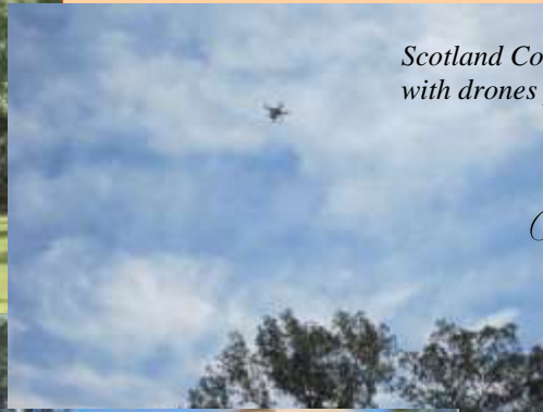
Scotland County Games go high-tech with drones photographing events!

We had a great time at Scotland County this year. The weather cooperated with sunshine and warmth and we had a great time visiting all our friends. For all you members out there, make sure you stop by our tents if you happen to be at any of these games – we’re there every year and would love the opportunity to meet you.