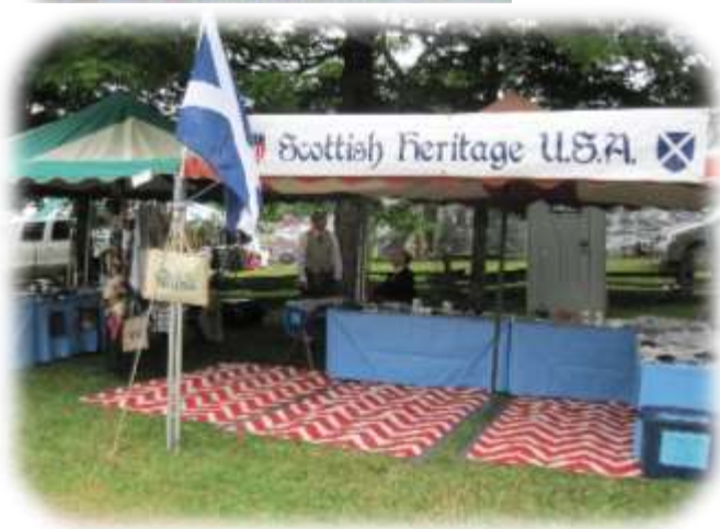
And it finally ends up looking like this!