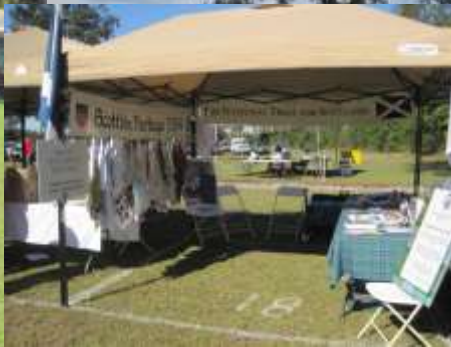
Even though our SCHG tent is smaller than at the other games, we do a brisk business and have interesting items for sale.