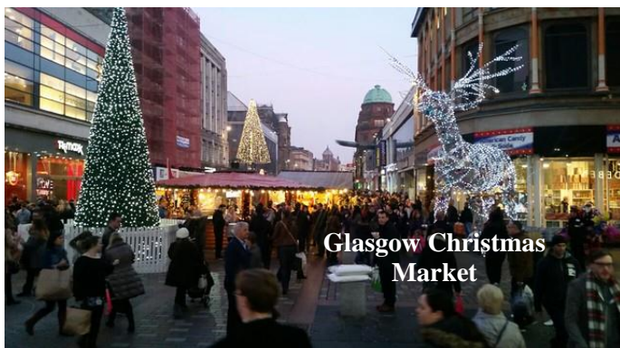
Glasgow Christmas Market

The market opened 20 November and runs through 23 December. If you are in Scotland, it's worth your while to visit this market!