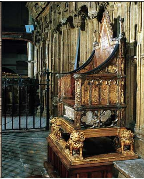
Stone of Scone in Coronation chair, Westminster Abbey 1875-1885