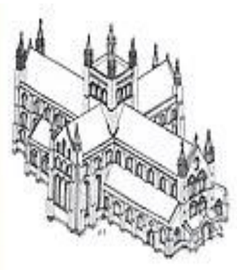
Reconstruction of how Scone Abbey would look

Traces of copper alloy were also found, suggesting it was in contact with a bronze or brass object ( possibly a relic such as a saint’s bell ), along with traces of gypsum plaster ( that could have been used to make a cast to fool Edward I ). That idea is unlikely as the Scots continued to ask for the stone’s return for some time after it was taken to London.