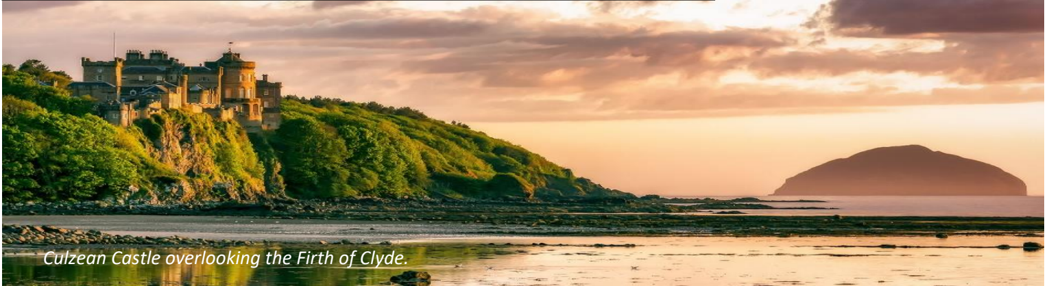
Culzean Castle overlooking the Firth of Clyde.

Scottish Heritage USA's storied history of support and partnership with the National Trust for Scotland reaches back to our very founding in 1965. As we celebrate our 60 th Diamond Jubilee year, a tale of historical significance to both Scotland and the United States springs forward. It starts with John Sheldon Doud Eisenhower, an early supporter and board director of Scottish Heritage USA.