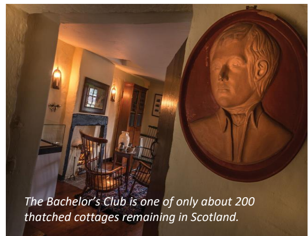
The Bachelor's Club is one of only about 200 thatched cottages remaining in Scotland.

These buildings convey connections to Robert Burns' formative years and the wider society he lived in. For people who love Burns, they have become evocative places of pilgrimage. But both buildings are suffering from damp and must be repaired and adapted for increased rainfall. This work is expected to cost $430,000. The National Trust for Scotland has committed $260,000 to the project, and Scottish Heritage USA is proud to represent our members in donating $10,000 of our annual National Trust for Scotland gift to this worthy preservation endeavor.